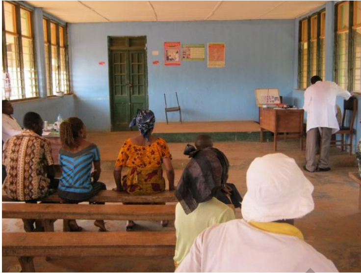
Fig 3: Subjects waiting to be examined at a health center at Ohafia L.G.A.

Analysis with the SPSS statistics software using the T test to test the relationship between the male and female subjects of these ocular diseases, the P value from the SPSS data output was 0.945 and this was higher than the 0.05 level of significance. This result means that there is no significant difference in the ocular effects of diabetes between the male and female subjects at Ohafia L.G.A., Nigeria.